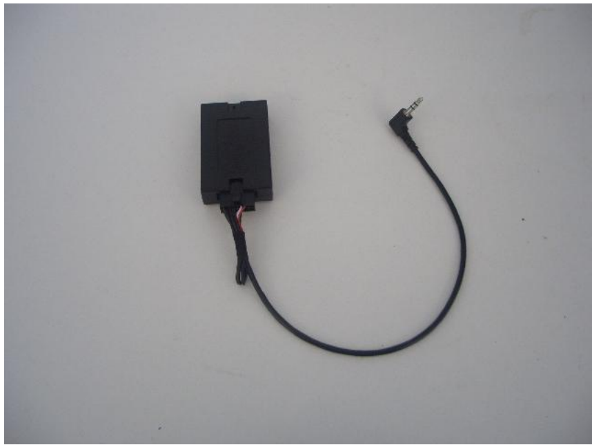
Ipod interface cable