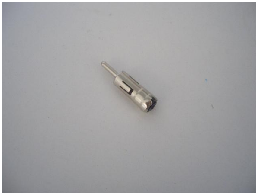
The GPS antenna.

The antenna adapter for earlier cars. Your cars may have plugs for both antenna adapters but you will want to use only the one below for proper radio reception.